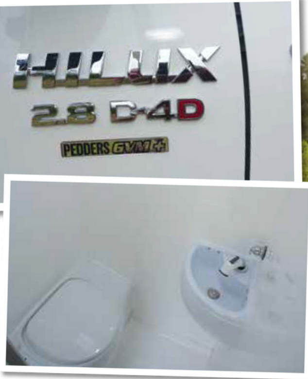
Clockwise from right: It definitely looks the part; The bathroom's compact but it gets the job done; A lean, mean, pristine machine