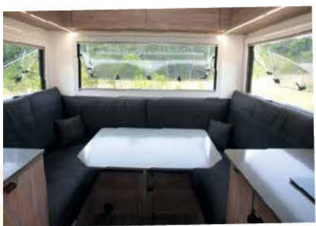
Clockwise from above: Plenty of light around the lounge; It's eye-catching alright; 93 litres of fridge space

Ventilation is well assured with two good sized windows on either side plus a large roof hatch. Indeed, the latter is large enough it's possible to stand on the bed and reach out to do something like clean the solar panels!